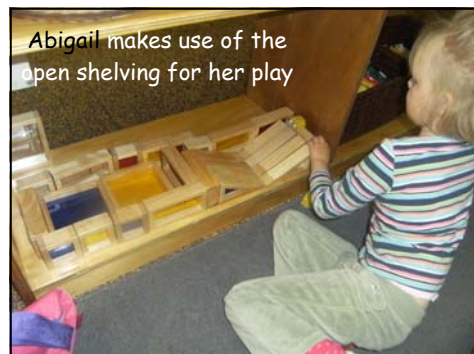
Abigail makes use of the open shelving for her play